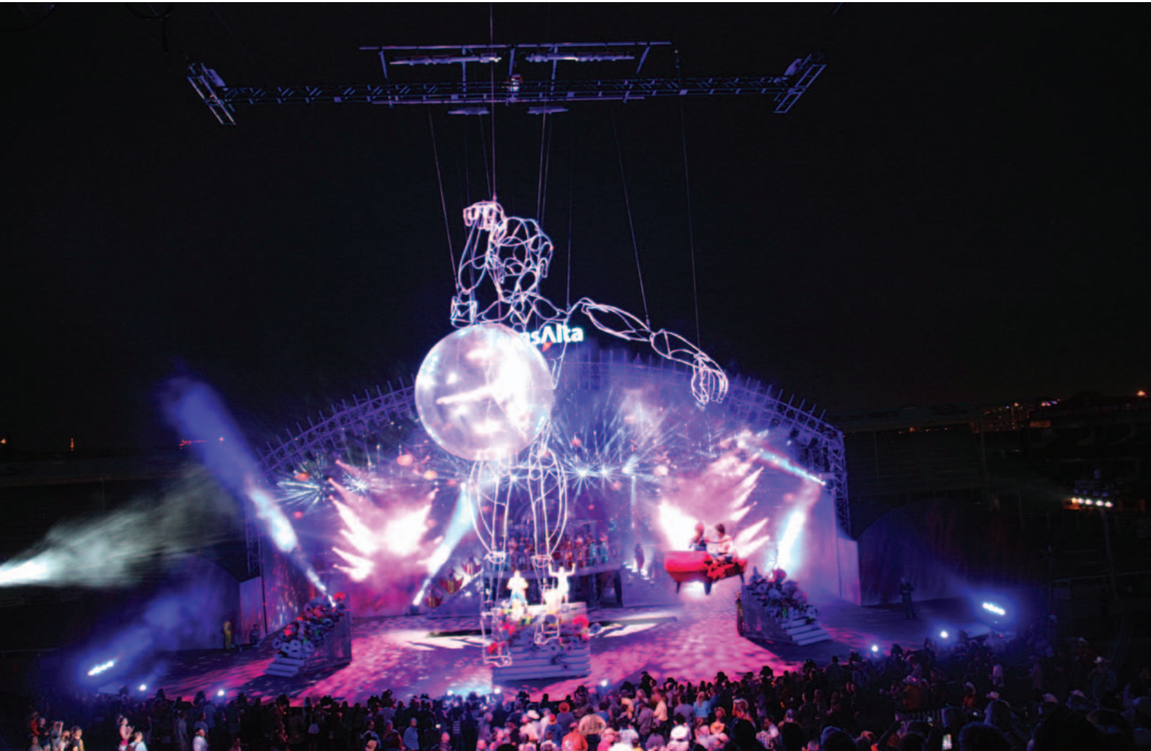
Flying a giant puppet and its performers at the TransAlta Calgary Stampede Grandstand Show in 2011.

pipeline company, and my stepfather was an expert woodworker who taught at a private school and built houses, furniture, and a full-sized train in his spare time. Although I didn't realize it at the time, each of these