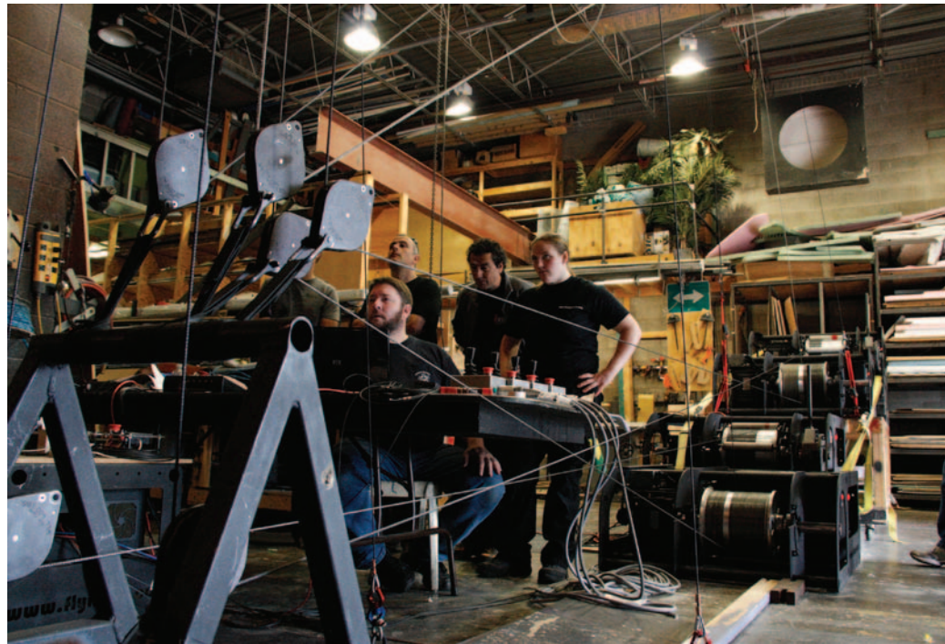
Teaching an automation workshop to students in 2009.

During my graduate studies at Florida State University, I created many elaborate rigging effects for our productions. Some involved flying scenery while others involved