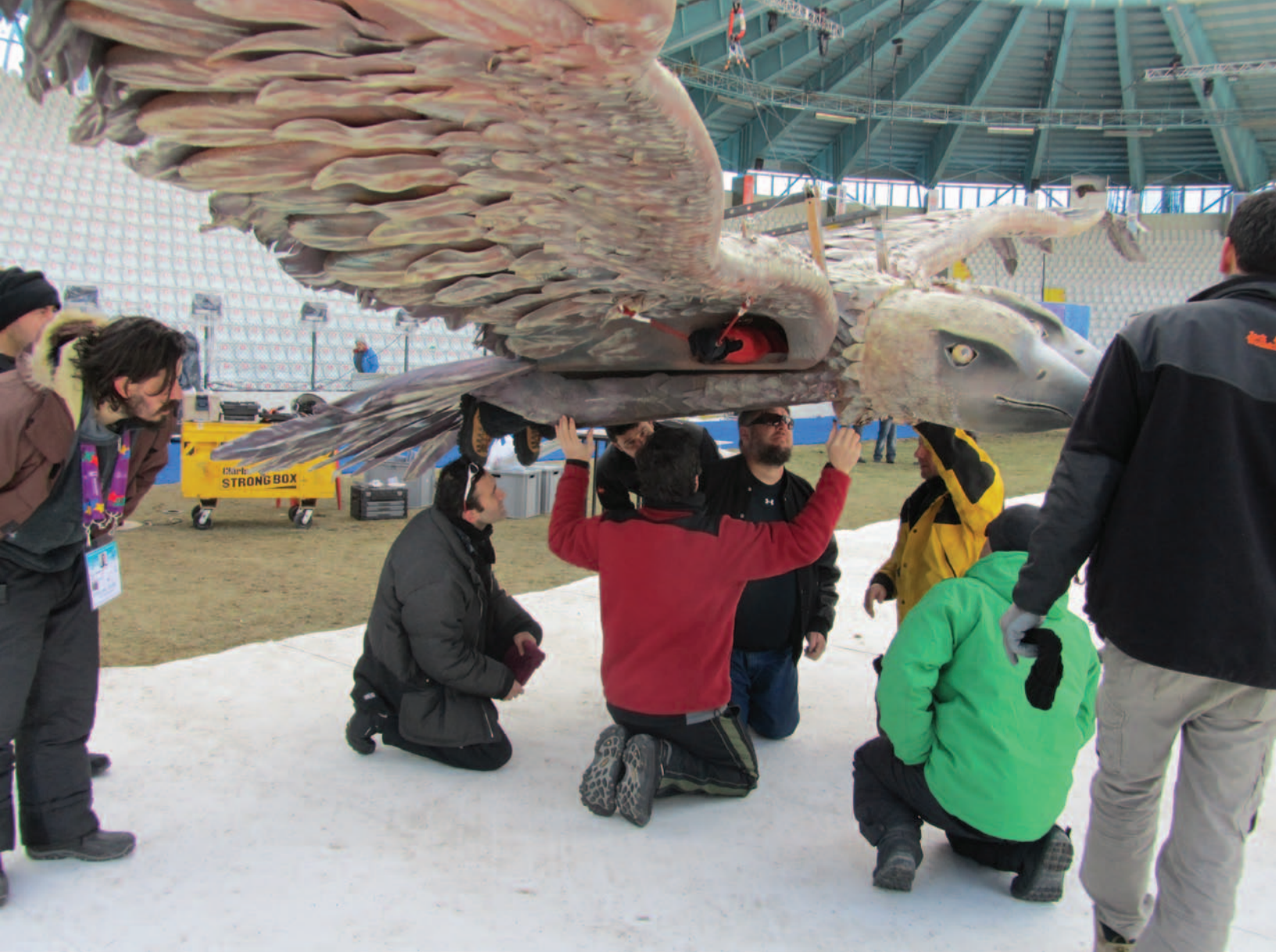
Inspecting an eagle prior to flying it during the 2011 Winter Universiade in Erzurum, Turkey.

called TOP Flight, usually presented near the end of summer. It's an opportunity for technicians, operators, performers, and others in the entertainment industry to either introduce themselves to flying effects or refine their skills on the subject. As an ETCP Recognized Trainer, it's also an opportunity to help certified individuals earn ETCP renewal credits.