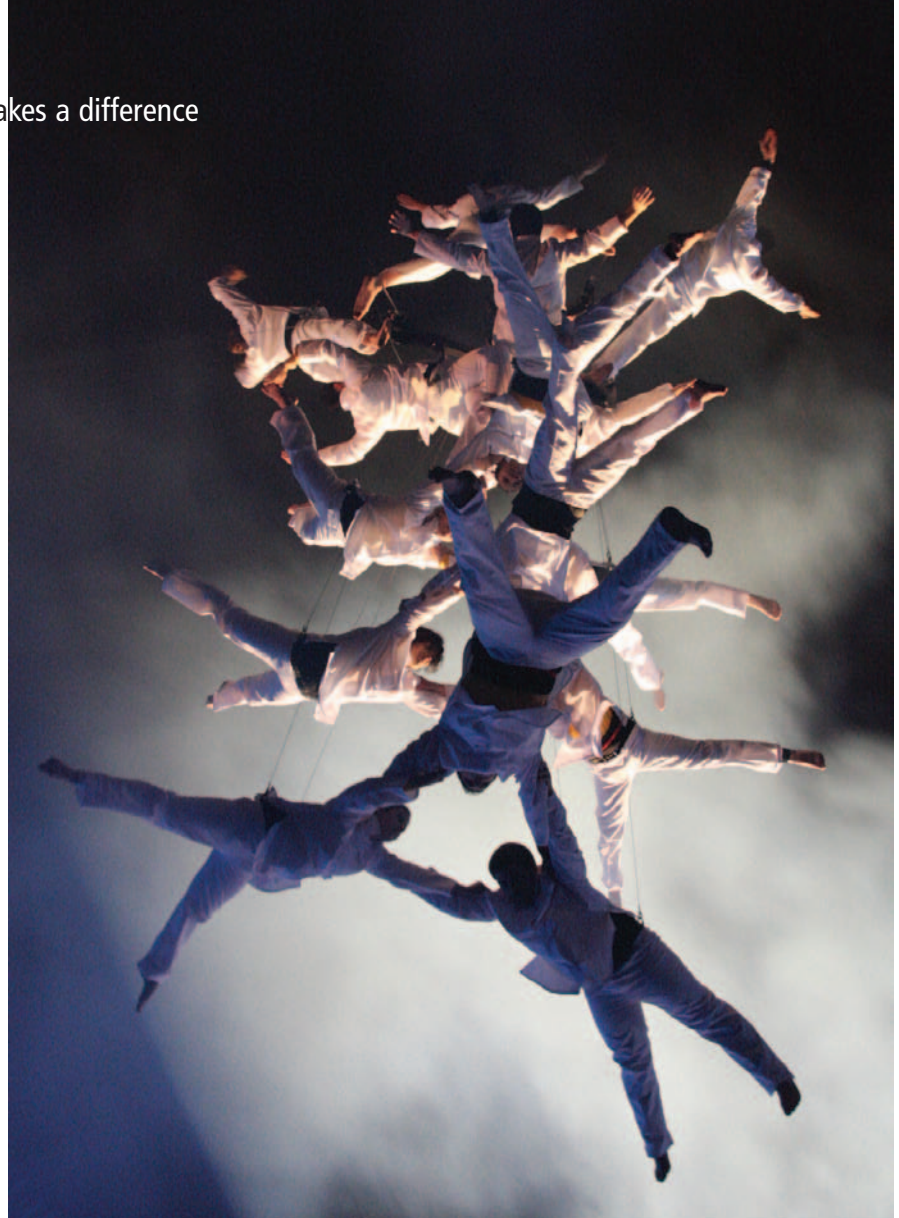
Creating the Human Castle with Accialt Flying Effects in Barcelona, Spain (2010).

Even though I have been teaching since 2000, I have continued to work as a professional rigger. I continue to design rigs for arena and ballroom shows, inspect and install fly systems in theatres, and design, build, and work with custom rigging equipment for my own company, Vertigo. As I reflect over the last 30 years, I realize how